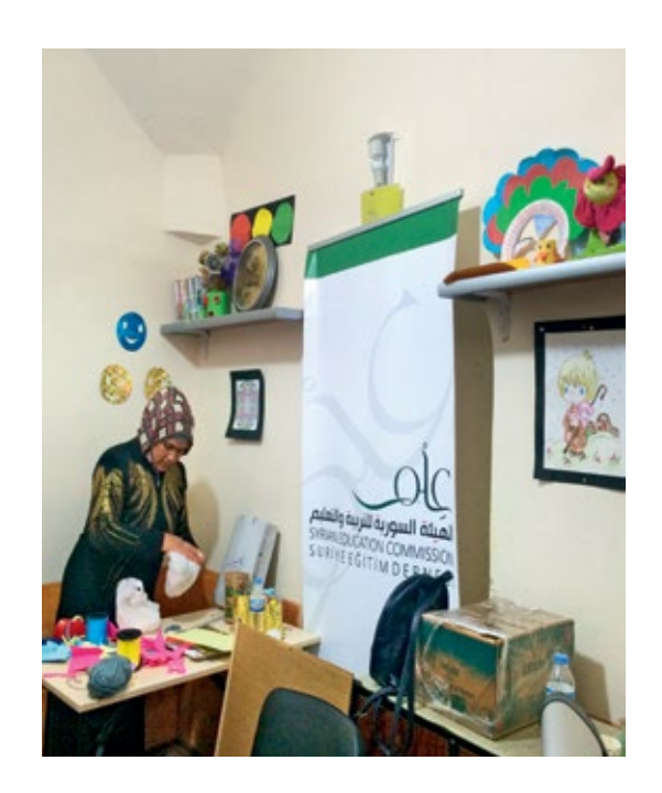
Inside Elmedresa Headquarters

Elmedresa (meaning "school" in Arabic) is an online learning platform launched by the Syrian Education Commission (SEC) in March 2016. The NGO was founded 2013 to teach Syrian children and teenagers in Turkey in Arabic and based on a Syrian curriculum. To begin with SEC was active in 32 schools and after expanding rapidly they now provide classes up to high-school level in 322 schools to around 300,000 pupils.