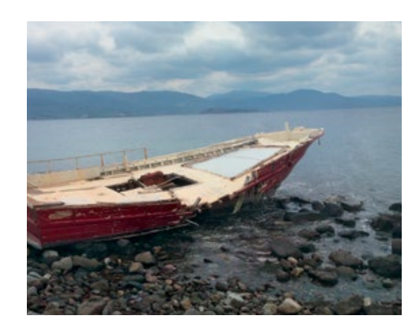
An boat lies abandoned on a beach on Lesbos

We can identify some strengths and weaknesses common in civic tech approaches in this space. We will return to these points in part 8 to suggest the most suitable areas and ways to engage these actors.