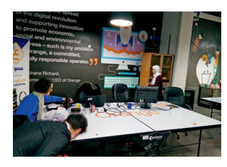
'Digital Projects Initiative' at the King Hussein Business Park.

However, at present there seems to be little spillover in the form of civic tech initiatives. Besides Edraak the only local civic tech initiative supporting refugees that we learnt of was 3DMena (see case study below).